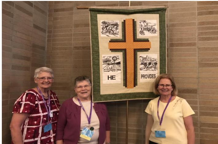
St. Paul Representatives with Lorain-Medina Zone Banner